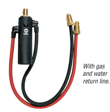
50 mm Dinse-Style Flow Thru 195380 For Syncrowave 210. Used with all Weldcraft<sup>™</sup> water-cooled torches.

For Maxstar 210/280/400, Dynasty 210/280/400 and Syncrowave 250 DX/350 LX. Used with all Weldcraft<sup>™</sup> water-cooled torches.