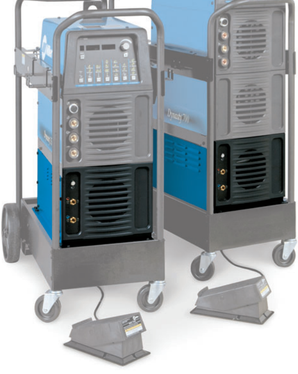
Coolmate 3.5 shown with Dynasty® 400 TIGRunner® and 700 TIGRunner®