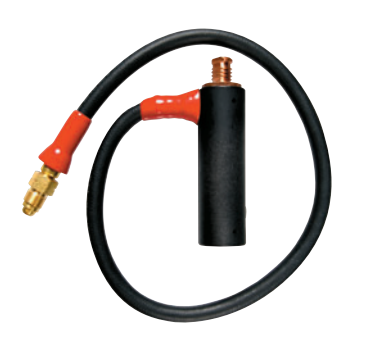
50 mm Thread-Lock-Style 225028 For Maxstar 700 and Dynasty 700. Used with all Weldcraft<sup>™</sup> water-cooled torches.